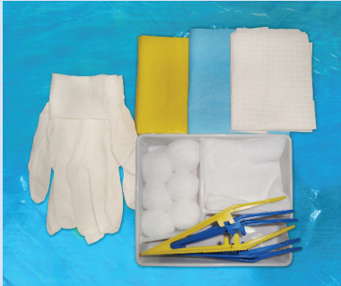
Disposable Dressing Pack (standard pack 2)