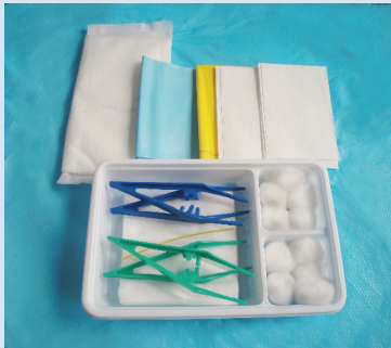
Disposable Dressing Pack (pack L)