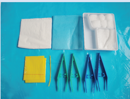
Disposable Dressing Pack (standard pack 3)