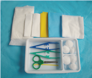
Disposable Dressing Pack (pack M with scissor)