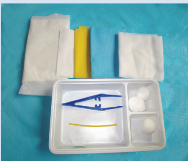
Disposable Dressing Pack (pack S)