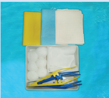
Disposable Dressing Pack (standard pack 1)